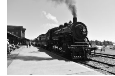
Steam Train at Depot during Heritage Days. Steam trains will run Fri, Sat, and Sun through September 15th.

Only with member and community support can we