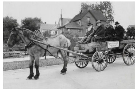
00.1583: Overland Freight Float in Pageant Parade 1929

September 27th, 1929 a holiday was declared in Two Harbors that closed businesses and schools at 2:30 PM. The holiday celebrated the paving of Trunk Highway 1 reaching Two Harbors. At 2:00 a convoy of cars