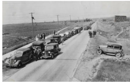
00.1583: Canadian Delegation celebrating dedication of concrete pavement west of Two Harbors c. 1932

drove from Two Harbors south to Knife River where they met a delegation from Duluth. The group