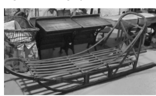
Beargrease's dogsled, as shown in LCHS Collections Storage, to be displayed in Depot Museum Galleries in time for Beargrease Dogsled Marathon Jan 26th 2020.

Small changes can already be seen in the museum as staff prepare to rearrange a portion of the Depot galleries.