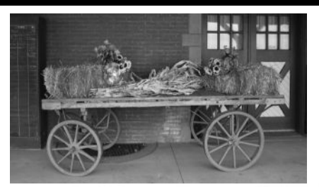
Anderson's Greenhouse & Florist 1403 7th Avenue