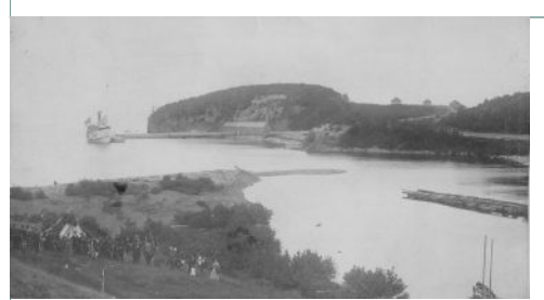
00.925: Passenger Boat at Weiland Dock, Beaver Bay c. 1883

A plat for the town of Beaver Bay was filed in Saint Louis County June 24, 1856. The signing of the LaPointe Treaty opened the North Shore to white settlement. Platted by Thomas Clark who chose the site due to its natural harbor at the outlet of Beaver River, the first steamer deposited Swiss and German settlers in the new townsite.