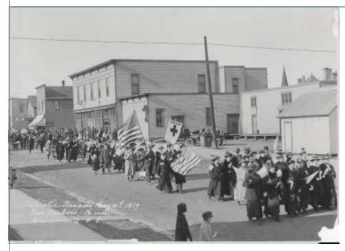
00.11.95: Red Cross in patriotic parade, May 4th 1917

In 1918, the Two Harbors Senior Class voted to forgo publishing the annual Agate yearbook and donate the funds to purchasing Liberty Bonds. The next publication, the Agate Victory Edition, details the efforts made by the community to support the war effort.