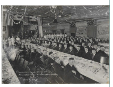
VE#99: 1919 Ex-Servicemen's banquet Armistice Day Two Harbors

the parade. Perhaps of such length will, in all probability, never again happen in Two Harbors until the city has attained a population of 300,000 souls.—Victory Agate, 1919, THHS