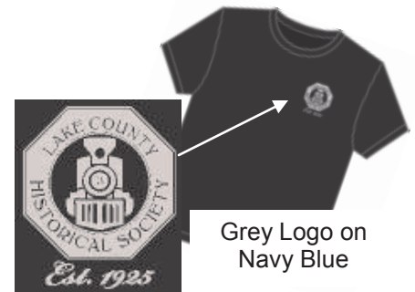
Grey Logo on Navy Blue

THE LAKE COUNTY HISTORICAL SOCIETY IS A 501C.3 NON PROFIT ORGANIZATION DEPENDANT UPON THE GENEROSITY OF IT'S MEMBERS AND PATRONS. THANK YOU FOR YOUR CONTINUED SUPPORT