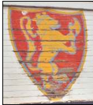
Coat of Arms Crown of Norway

It is important to remember at this time the Society owned no property, and only had recently secured a five year lease to open the Light Station as a museum. There must have been a lot of discussion for the Society has plans in our archives that feature parking lots and access roads to the light station engineered by the Lake County Highway Department. Included is a letter from the State Historic Preservation Officer encouraging the Society to locate the Crusader II in a location that would not detract from the views of the Light Station which had been placed on the National Historic Register in 1981. To the best of my knowledge, it appears that the plans to relocate the boat on light house point were delayed while the DNR completed renovation of the public boat launch.