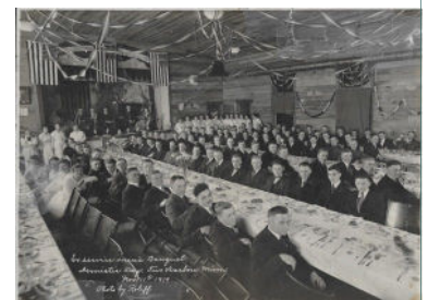
VE#99: 1919 Ex-Servicemen's banquet Armistice Day Two Harbors

the parade. Perhaps of such length will, in all probability, never again happen in Two Harbors until the city has attained a population of 300,000 souls.—Victory Agate, 1919, THHS