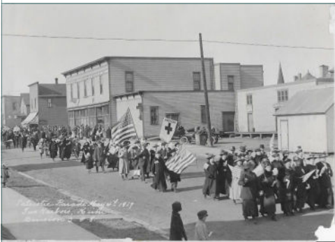
00.11.95: Red Cross in patriotic parade, May 4th 1917

In 1918, the Two Harbors Senior Class voted to forgo publishing the annual Agate yearbook and donate the funds to purchasing Liberty Bonds. The next publication, the Agate Victory Edition, details the efforts made by the community to support the war effort.